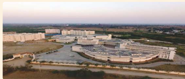
Symbiosis - International University

Plan Showing the proposed residential layout in Sy. Nos. 10/P & 13/P situated at Burgula Village, Farooqnagar Mandal, Ranga Reddy District.