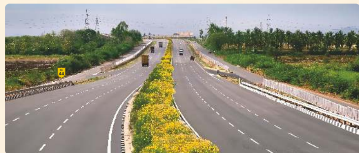
Hyderabad - Bangalore NH - 44