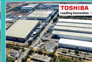
Toshiba Innovation Plant