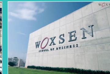
Woxsen School of Business