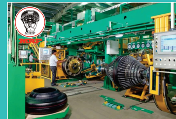
MRF Tyres Company