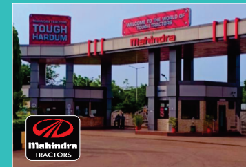
Mahindra Tractors Company