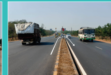
Mumbai HW - 'U' Turn close to the project