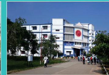
MNR Medical College