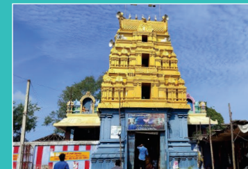
Ketaki Sangameswara Swamy Temple